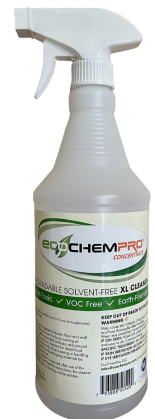
32oz Spray Bottle