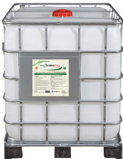
275 Gal Tote

When you combine the forces of nature with science you create cleaner, safer more sustainable products.