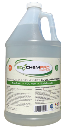
1 Gal Bottle