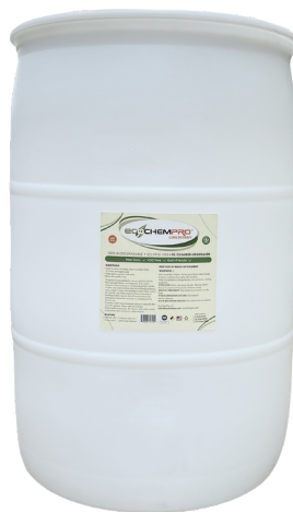
55 Gal Drum