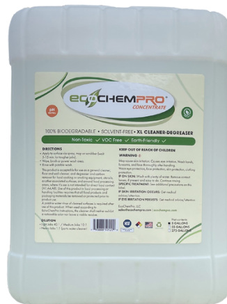
5 Gal Cube